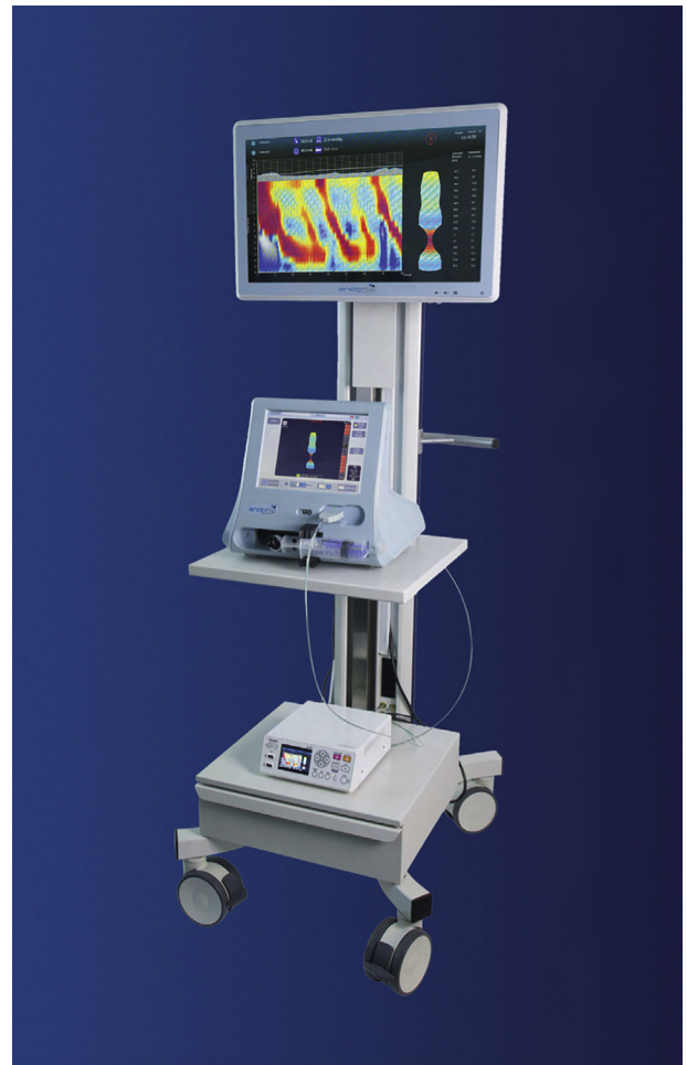
Figure 1. Image of an EndoFLIP system.

FLIP uses high-resolution impedance planimetry during volume-controlled distension to quantify the relationship between luminal geometry and pressure in the assessment of the mechanical properties of the esophageal wall and esophagogastric junction (EGJ). 5 Specifically, FLIP analyzes the relationship between luminal cross-sectional area (CSA) and pressure, which provides a measure of luminal distensibility (CSA/pressure). The technology consists of a multielectrode probe and proprietary software