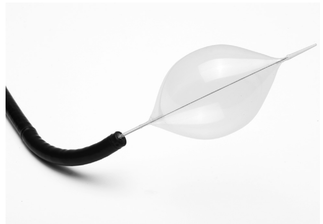
Figure 2. NaviAid ABC balloon catheter.

The Vizballoon (Visualization Balloons LLC, Roseland, NJ) is a urethane balloon catheter that is intended to facilitate colonoscope insertion without the use of gas insufflation. The balloon catheter requires a colonoscope