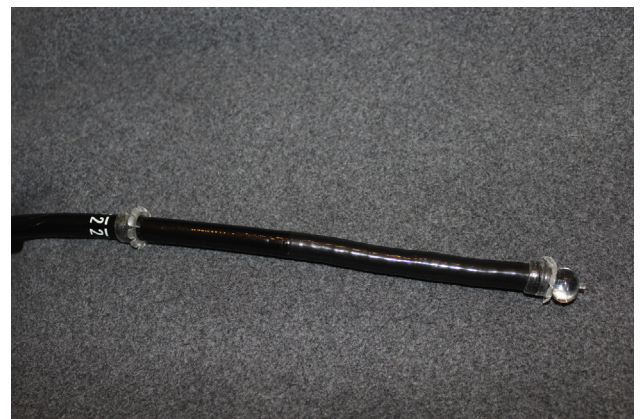
Figure 3. Vizballoon and associated Daisycuff.

channel diameter of \geq 3.2 mm and is used in conjunction with a short clear distal attachment (cap). After advancement of the catheter through the instrument channel, the balloon is inflated with saline solution to a diameter that approximates that of the colonoscope; the saline solution-filled balloon functions like a goggle in front of the colonoscope that allows for navigation through a nondistended colon (Fig. 3). The balloon also limits the “red-out” effect seen at acute angulations or from a spastic lumen, improving visibility. The manufacturer recommends the concurrent use of 2 elastic polymer pleating rings mounted on the shaft of the colonoscope insertion tube (Daisycuffs; Visualization Balloons LLC) (Fig. 3).