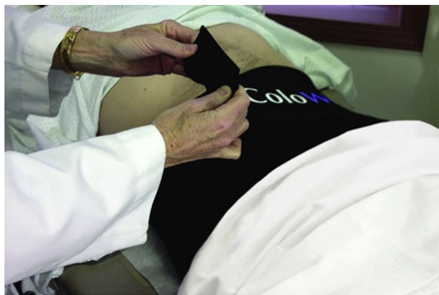
Figure 4. An example of an abdominal compression device (ColoWrap, LLC, Durham, NC) placed on a patient before colonoscopy.

encircles the patient's abdomen, applying constant pressure throughout the procedure (ColoWrap, LLC, Durham, NC) (Fig. 4). 34,35 ColoWrap is a single-use neoprene adjustable wrap that provides general lower abdominal compression, with a Velcro closure to allow for customized fitting. An additional support strap provides compression to the area overlying the sigmoid colon. The standard size ColoWrap is 100 cm × 25 cm. Other sizes are also available: small (90 cm × 20 cm), large (115 cm × 25 cm), and extra-large (130 cm × 25 cm).